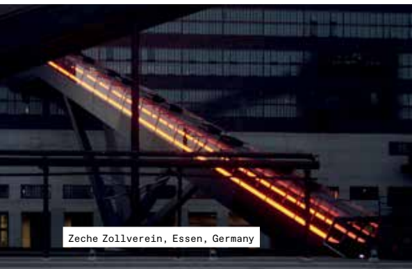
Zeche Zollverein, Essen, Germany

In public urban environments, escalators and moving walks are much more than a clever means of transport. They connect people and places to ensure accessibility for all – to and from historic city centers, public infrastructure and cultural sites. At TK Elevator, we are proud to have contributed our expertise and products to many outstanding projects in Europe and around the world.