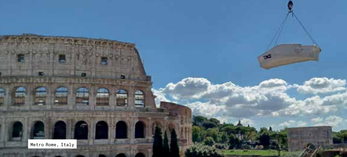
Metro Rome, Italy

In public urban environments, escalators and moving walks are much more than a clever means of transport. They connect people and places to ensure accessibility for all – to and from historic city centers, public infrastructure and cultural sites. At TK Elevator, we are proud to have contributed our expertise and products to many outstanding projects in Europe and around the world.