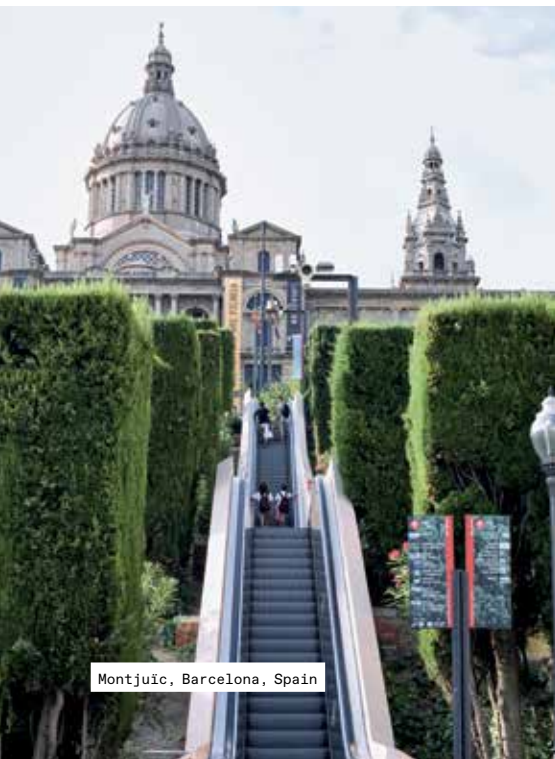
Montjuïc, Barcelona, Spain