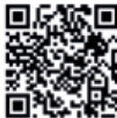
20 Years of TWIN