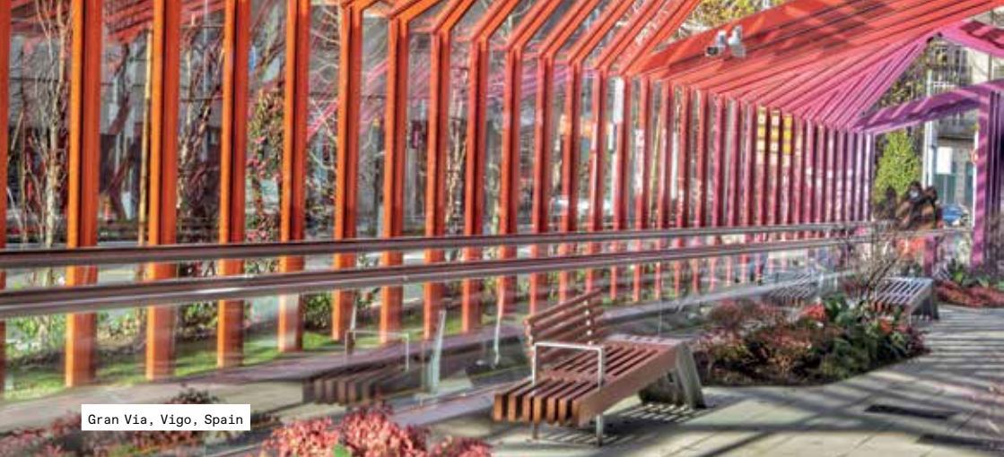
Gran Via, Vigo, Spain