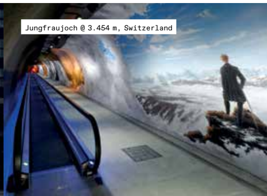
Jungfrauoch @ 3.454 m, Switzerland