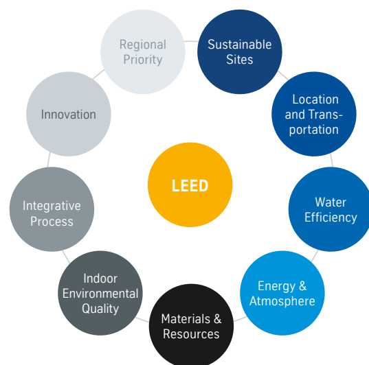
LEED v4.1 categories overview

You can find further information here: www.usgbc.org/leed