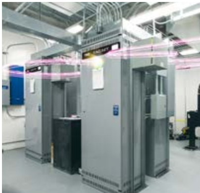
MAX works onsite 24/7/365.

We're continuously improving MAX, so you can expect its benefits to get bigger and better over time.