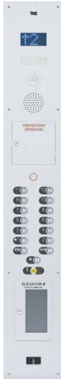
Car operating panel

Linear door operator with permanent magnet drive motor for quick, smooth and quiet elevator door operation.