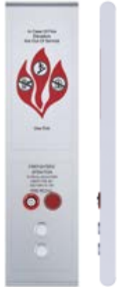
Intermediate hall station with fire services devices