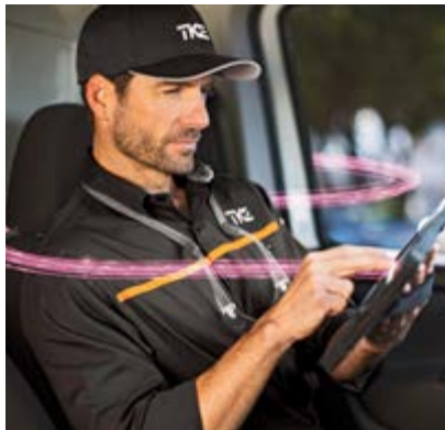
MAX sends equipment diagnostic analysis.