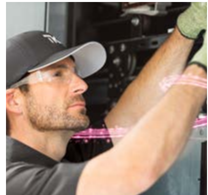
Repairs are completed in less time.