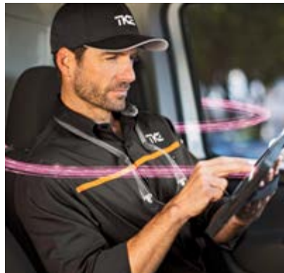
MAX sends equipment diagnostic analysis.