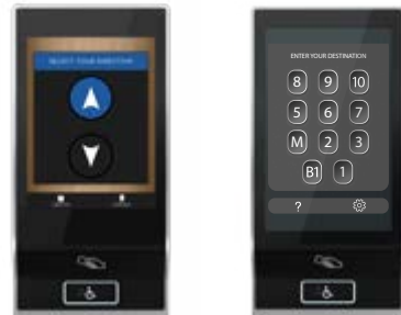
AGILE kiosks can be programmed to handle either traditional up-and-down mode (left) or ETD mode (right) depending on your building's needs.

You can customize the kiosk backgrounds with preloaded options — or upload your own.