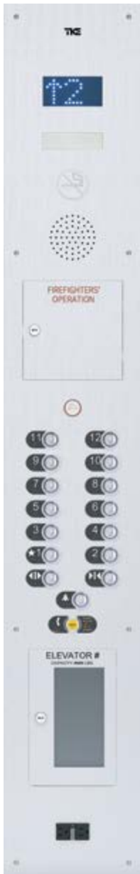
Car operating panel

Linear door operator with permanent magnet drive motor for quick, smooth and quiet elevator door operation.