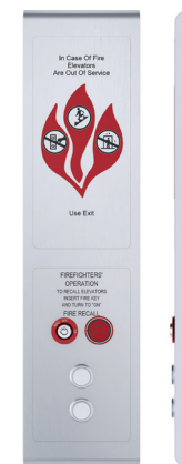
Intermediate hall station with fire services devices

A light fixture mounted in the hallway that provides visual and audible indication that a car is about to arrive and the direction of travel when it leaves.