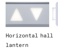
Horizontal hall lantern

From new buttons and indicators to smoother door operation, passengers will instantly notice you've modernized. Our comprehensive selection of fixtures, included with your modernization, is easy to install and safe for walls. All fixtures are in full compliance with U.S. and Canadian National Fire Service Codes.