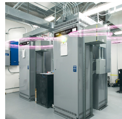
MAX works onsite 24/7/365.

We're continuously improving MAX, so you can expect its benefits to get bigger and better over time.