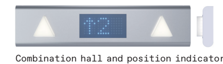
Combination hall and position indicator

A sleek hall and position indicator combination that can be mounted in your hallway or lobby.