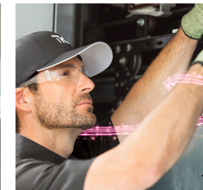
Repairs are completed in less time.