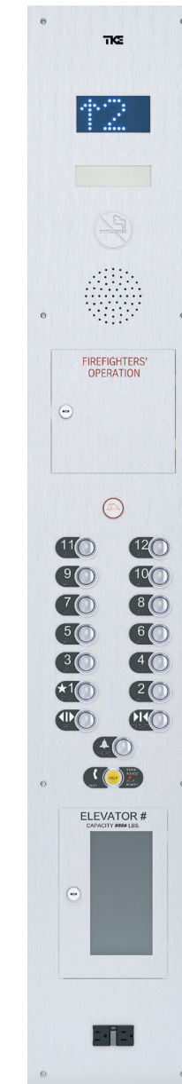
Car operating panel

Linear door operator with permanent magnet drive motor for quick, smooth and quiet elevator door operation.