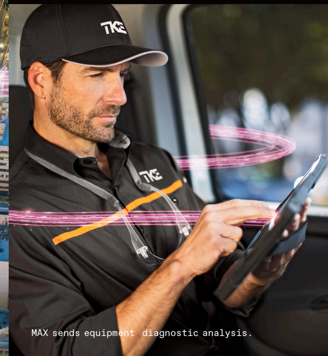
MAX sends equipment diagnostic analysis.