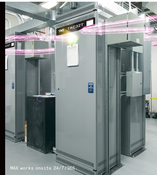
MAX works onsite 24/7/365.

In the near future, we'll also be introducing digital subscription packages that let you use MAX to enhance your elevator service agreement and better manage your building.