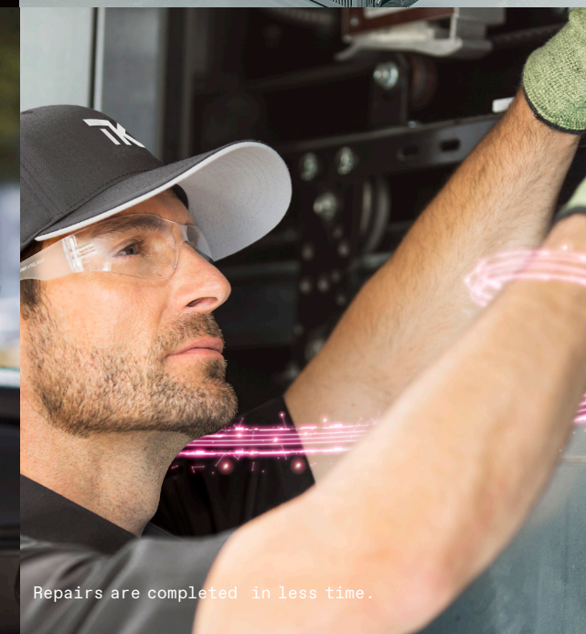
Repairs are completed in less time.